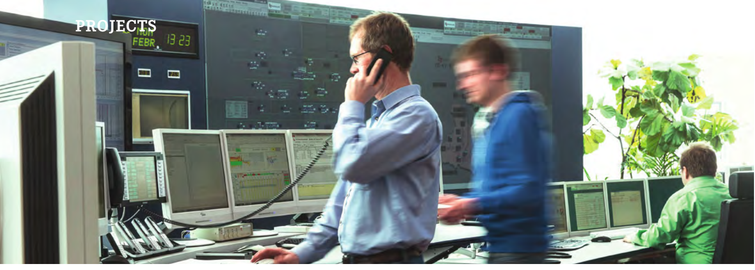
Load dispatching center, Salzburg AG